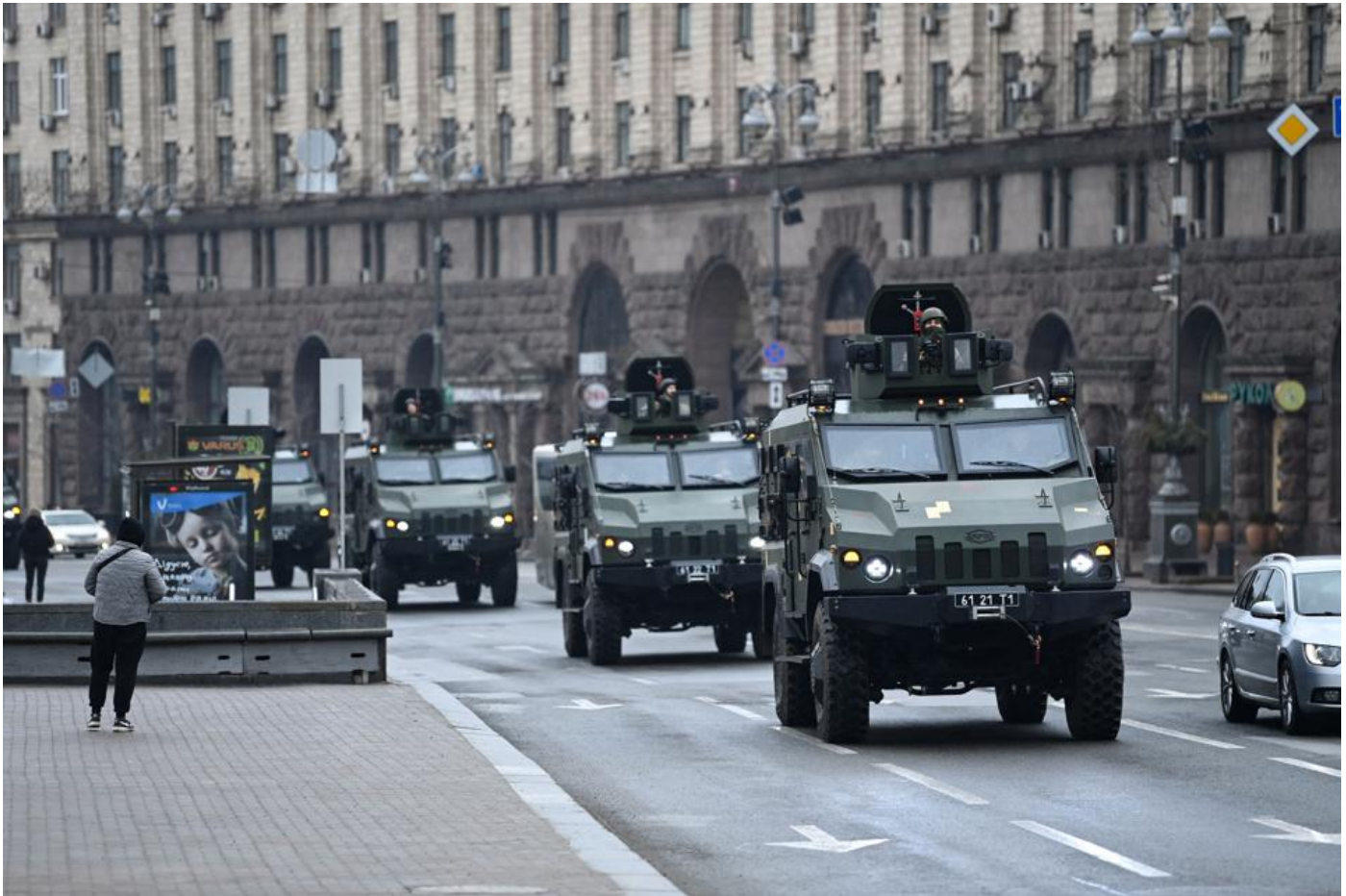
TOPSHOT - Ukrainian military vehicles move past Independence square in central Kyiv on February 24, ... [+]